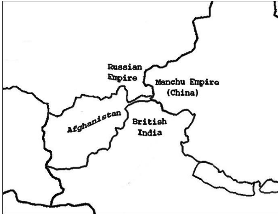
Map created by author.